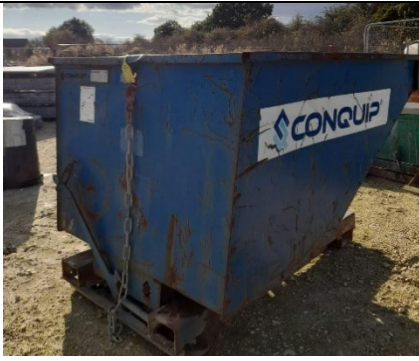
Manual operated skip