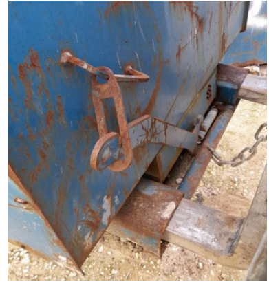
Manual operated skip, showing safety catch