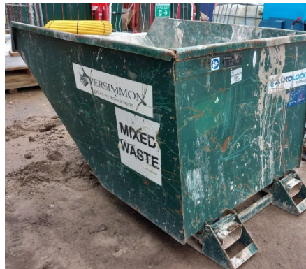
Auto-locking skip, no catch/ rings or chains needed